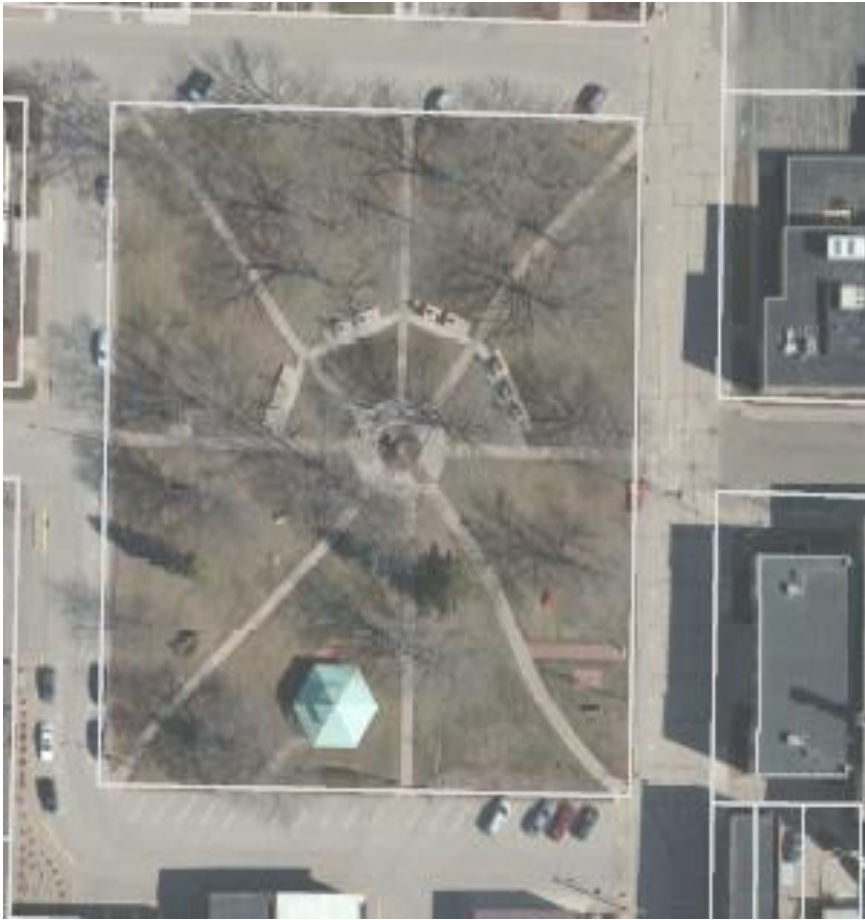
Detail of central area of park where professionals will